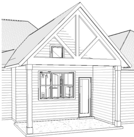
REAR PORCH PERSPECTIVE

10'-1", 11'-1" # 14'-1" PLATE HEIGHTS - 10', 11' CLGS. 4:12, 9:12, 12:12 # 16:12 ROOF PITCH